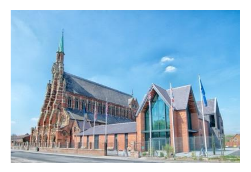
The Monastery, Gorton

The conference venue, The Monastery, Gorton, is a part of the long history of monastic medicine and the Franciscan focus on giving care to the poor.